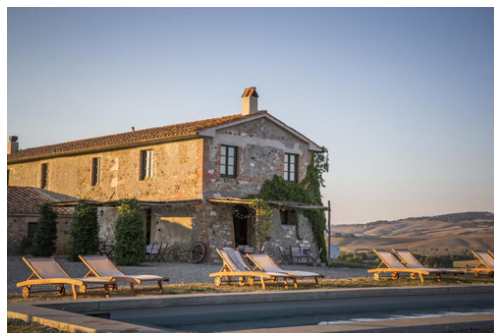
Above: explore the hot springs of Bagno Vignoni. Left and far left: there are idyllic rural views aplenty from every angle of the guest house